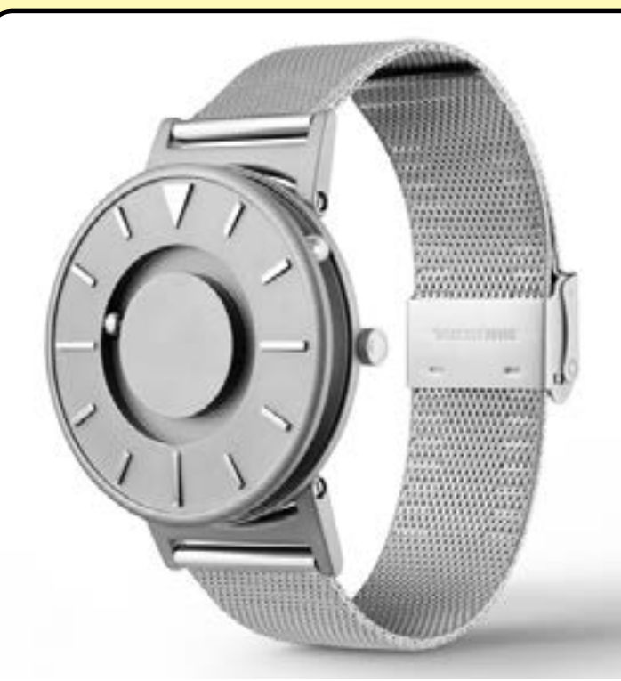
The "Bradley" Ball Bearing Tactile Watch

As many of you will know we have a number of watches and clocks designed for use sight impaired people. by Well now we have augmented our range of devices with a selection of watches from a company called Lifemax. One of their "stand out" products is pictured opposite. It is a Radio Controlled Talking Calendar Watch with a difference, in that it is light powered! It actually does have an internal battery which is constantly recharged when the watch is exposed to light. It doesn't matter whether it is sunlight or artificial light!